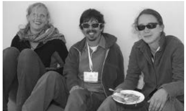
Arcata Recycling group enjoys munchies onboard.