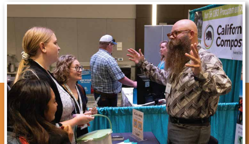
Innovative Exhibit Hall