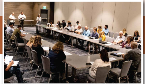
Growth and Development

916.441.2772 • info@crra.com California Resource Recovery Association